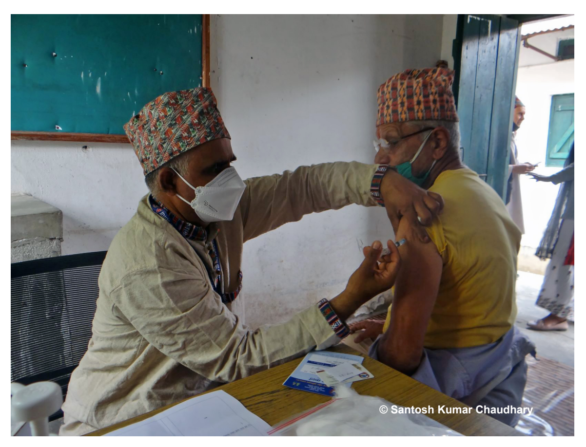
An 83-year old Bhutanese refugee receives a COVID-19 vaccination at the Beldangi refugee settlement in eastern Nepal.